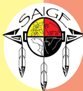
Society of American Indian Government Employees