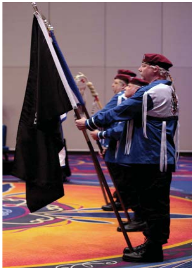
Mohegan Color Guard