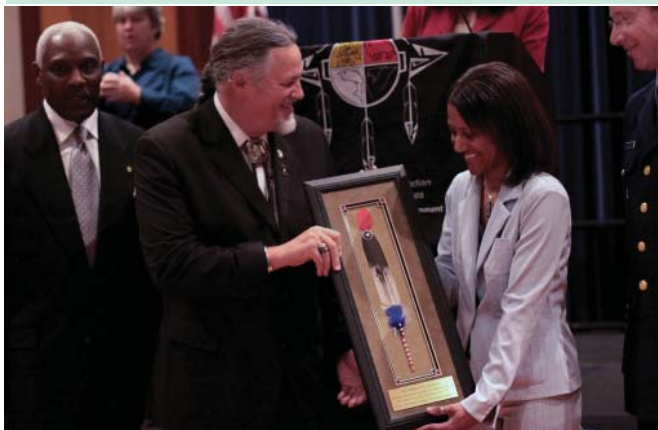
Dept. of Defense (DOD) Banquet and Awards Ceremony.